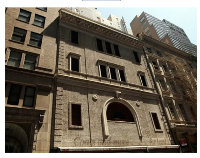
The proposed Mosque site near ground zero

NEW YORK (CBS 2) — For weeks we've heard Gov. David Paterson say he's got a plan to move the so-called ground zero mosque to another site.